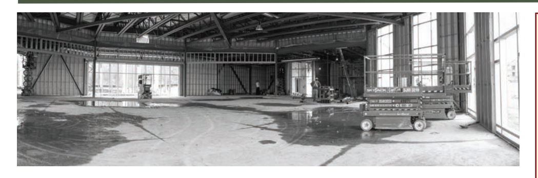
Our future parish hall which will sit about 400 people auditorium style, thanks to your continued financial support to our Building Fund